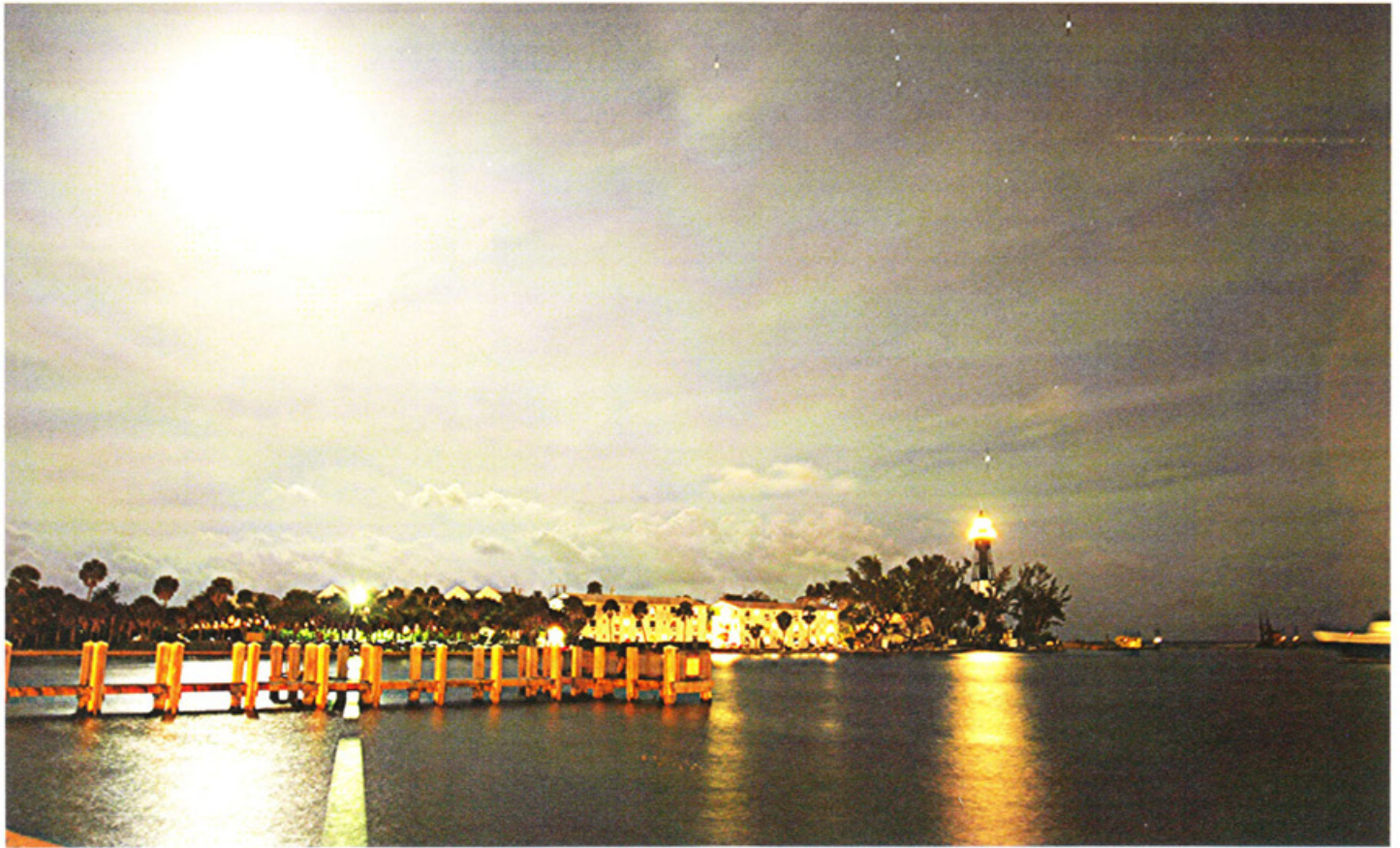
“Hillsboro Inlet Light Station at Full Moon” by David J. Shing, Photographer.

Hillsboro Lighthouse Preservation Society, Inc. (New) P. O. Box 610326, Pompano Beach, FL 33061-0326